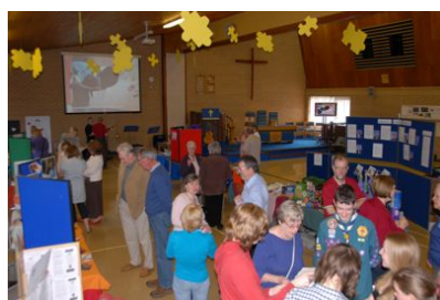
"Gifts for God" Stewardship event