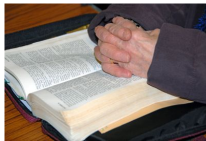
Prayer and Bible Study groups