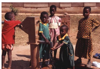
Engcongolweni Water Project