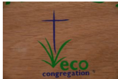
We are a Fairtrade and ECO congregation

The congregation is fairly typical of a Church of Scotland parish but many of the members come from other parts of the UK and wider afield with the result that they have come from other reformed church traditions.