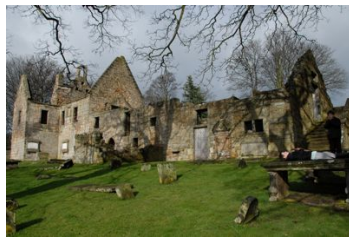
St Bridget's Kirk

The town of Dalgety Bay forms the largest part of the parish but the boundaries include part of the adjacent village of Hillend to the west. The eastern boundary is halfway to Aberdour while, to the north the parish includes Fordell Firs, which is the headquarters of Scottish Scouting.