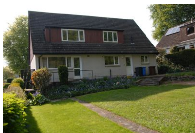
The manse (rear view)

Upstairs there are four bedrooms and a family bathroom. The property is double glazed and centrally heated by gas. It also has a security alarm.