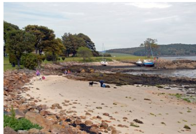
Dalgety Bay Primary School (top left), some of the housing in the town, Playpark in front of school and the beach near the Sailing Club

Building started in the town in the 1960s and it has now reached its natural boundaries. New houses are still being constructed but it is unlikely that planning permission would be granted for any further building. Most of the houses are privately owned.