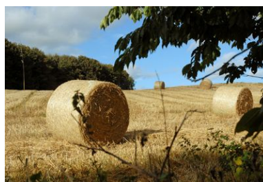
The manse is very close to open countryside