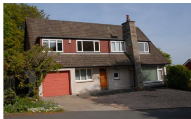
The manse (front view)

The Manse is a sizeable villa situated on the eastern side of town but only two minutes' drive from the Church.