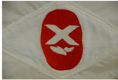
Forth Churches Guild