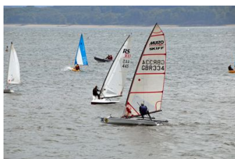
Dalgety Bay Sailing Club

Employment is found in two industrial estates to the north of the town where a number of manufacturing and service companies are located. Most people, however, find their employment furth of Dalgety Bay.