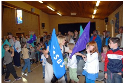
Junior Church in action

Café Connect provides refreshments on a Tuesday morning and the Badminton Club meets on a Wednesday evening.