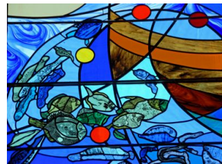
Stained glass window (detail)

The Parish Church, which is located in the centre of town, can trace its history back for over 800 years. Two former parish church buildings can be found on the eastern side of town. St Bridget's Kirk is a ruin and in the care of Historic Scotland while the 19th century building is now owned by the Cornerstone Full Gospel Church. There are no churches of other denominations in the Parish.