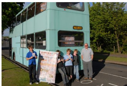
The Connexion youth group